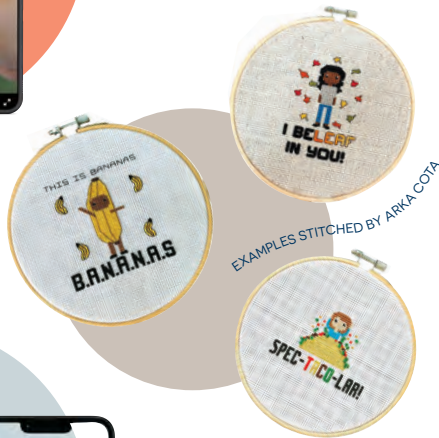
EXAMPLES STITCHED BY ANKA COTIA